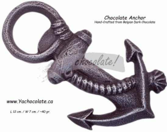
Chocolate Anchor Hand-Crafted from Belgian Dark Chocolate