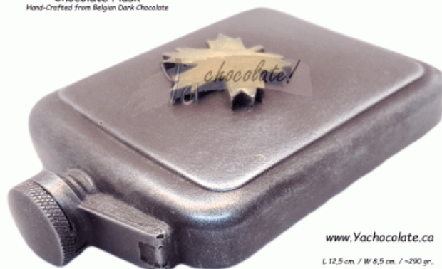
Chocolate Flask Hand-Crafted from Belgian Dark Chocolate