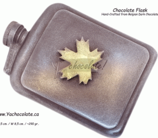
Chocolate Flask Hand-Crafted from Belgian Dark Chocolate